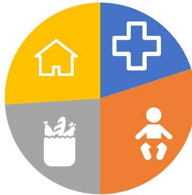
Physicians – Asheville