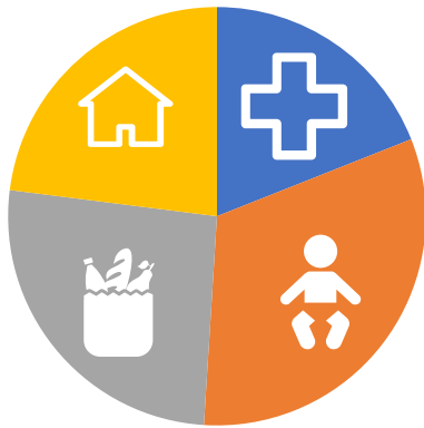
Physicians – Raleigh